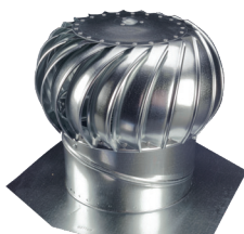
GEB-12 & GT-12 (shown) GALVANIZED STEEL TURBINE †ADJUSTS TO 7/12 ROOF PITCH AVAILABLE IN MILL ONLY